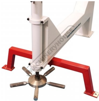
Fine Adjustment Hand Wheel