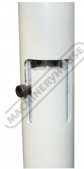
Quick Action Swivel Bottom Roller Die