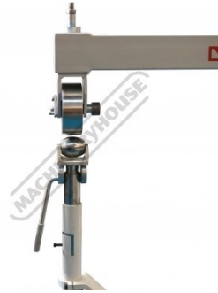
Cam Action Material Clamp head