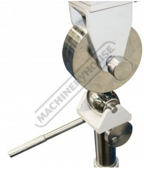
Roller & Die Head