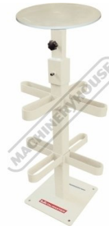
Shown with Optional Stand S2238