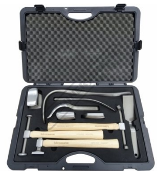
H887 Auto Panel Restoration Kit - Master