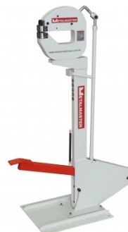
S2266 Foot Operated Shrinker Stretcher - Heavy Duty