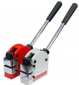
S2262 Shrinker & Stretcher - Bench Mount