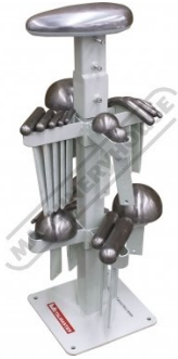
Stand Shown With Optional Dollies