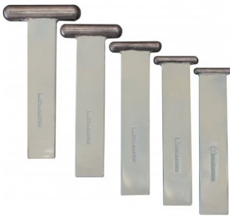
S2232 Tapered Steel T-Dolly Set - 3 Piece