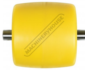
8" Radius Anvil