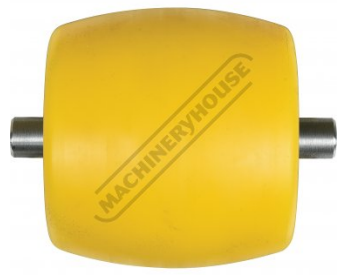
4" Radius Anvil