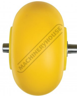
1 1/4" Radius Anvil