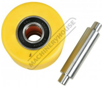
Anvil with Shaft