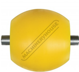
2" Radius Anvil