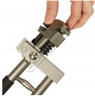
Swivel Head Action