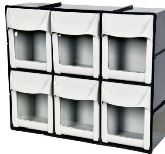
S0362 Parts Storage Bin System