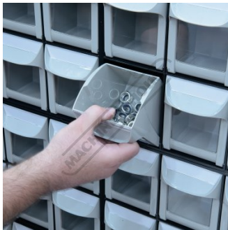
Removable Bins For Easy Access & Refilling