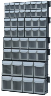
S0351 Parts Storage Bin System