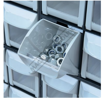
Bins Open Smoothly To a 40° Angle