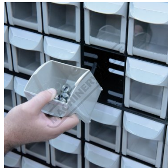
Removable Bins For Easy Access & Refilling