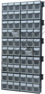
Few Buckets Shown Open