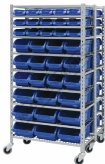
Shown Back to Back