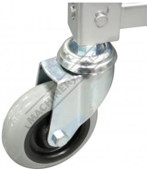
4 x Swivel Wheels