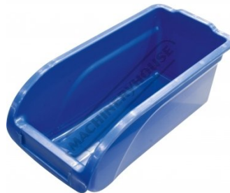
Bin 345x140x150mm Max Loading 28kg