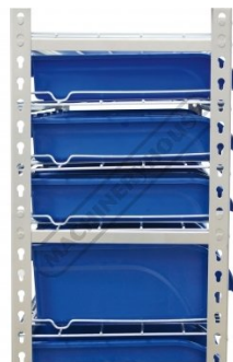
Rack Side View