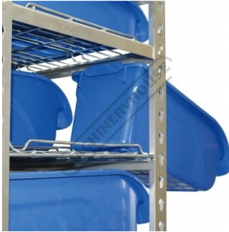
Bin Stop System