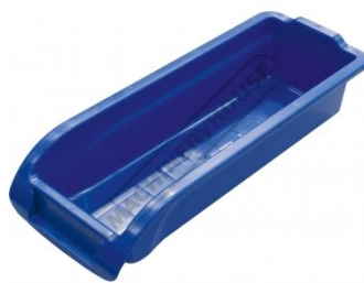
Bin 345x105x75mm Max Loading 20kg