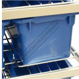
Bin Locating Guides