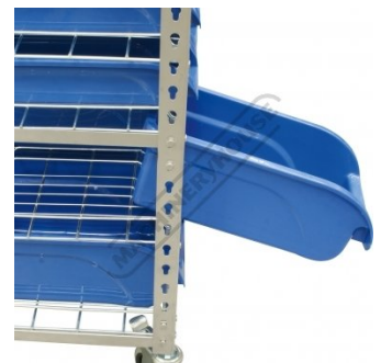
Bottom Bin Side View