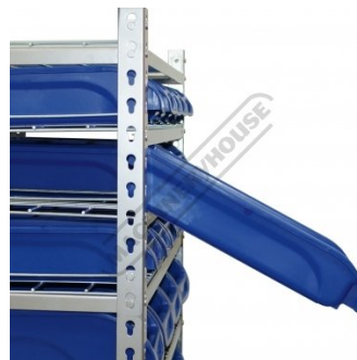
Top Bin Side View