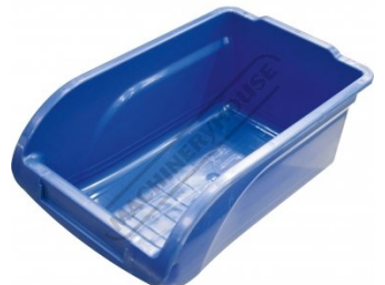
Bin 345x205x150mm Max Loading 30kg