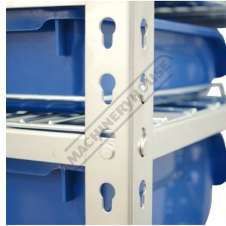
Quick and Easy Adjustable Shelf System