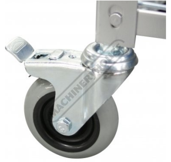
2 x Swivel Brake Wheels