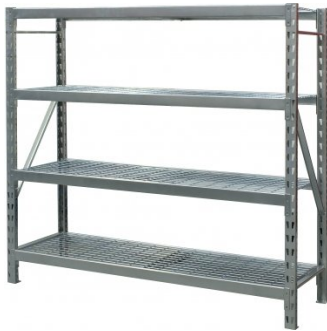
S014 Industrial Steel Shelving