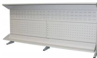
A426 Industrial Backing Panel - Bench Mount