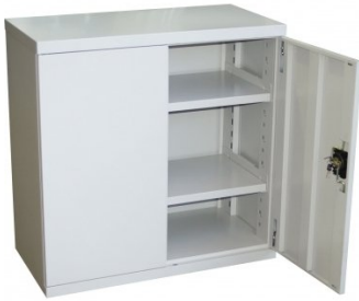
T774 Industrial Storage Cabinet