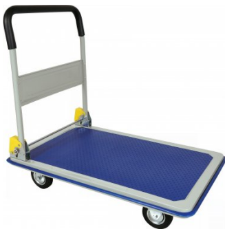
T670 Platform Trolley - 300kg Capacity