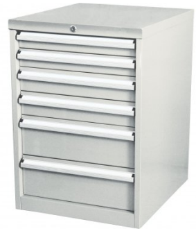
T764 Industrial Tooling Cabinet