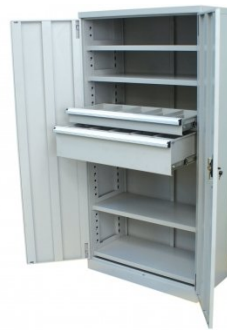
T762 Industrial Storage Cupboard