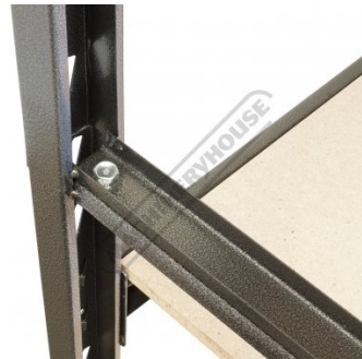
Vertical Frames Bolt Together