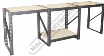
Single Unit Configuration Work Bench