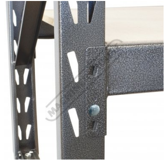
Clip in Supports with Safety Pin