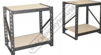
Single Unit Configuration