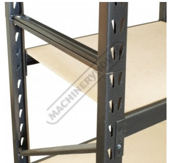
Industrial Steel Frame