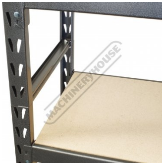
Deep Particle Board Shelves