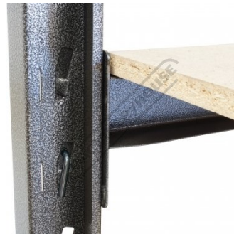
Safety Pins for Support Arms