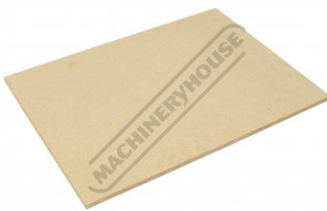
Supplied with 4 x Sheets of Particle Board