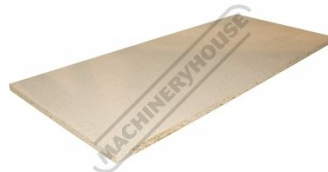
Supplied with 4 x sheets Particle Board