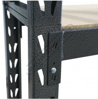
Clip in Supports with Safety Pin