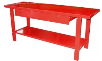
A380 Steel Work Bench - 3 x Lockable Drawers