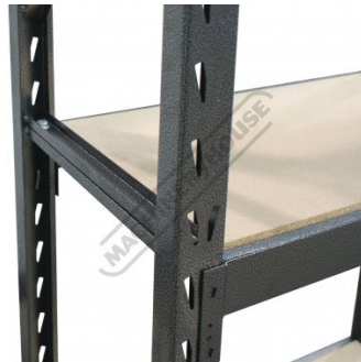
Industrial Steel Frame