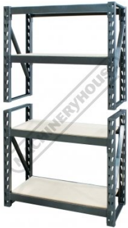
Vertical Frame Bolts Together