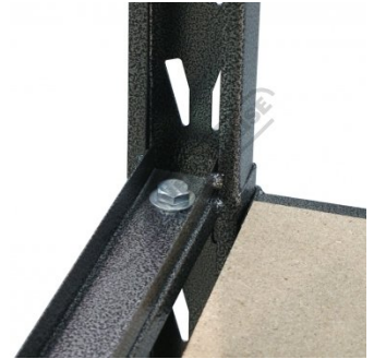
Vertical Frames Bolt Together