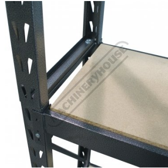
Steel Support Beams