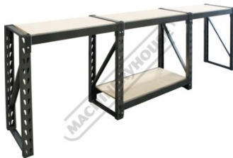
Single Unit Configuration WorkBench