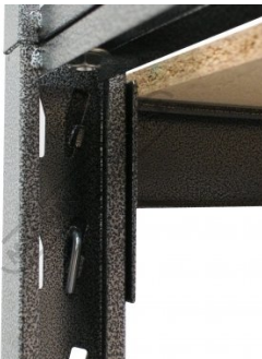
Safety Pins for Support Arms