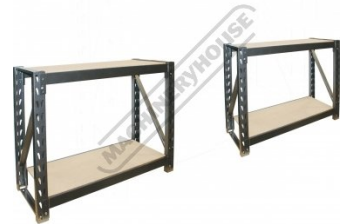
Single Unit Configuration