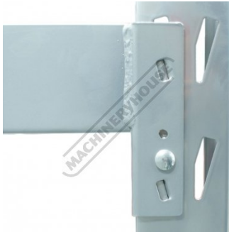
External Shelf Locking System