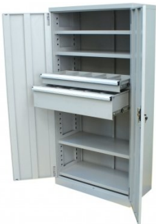
T762 Industrial Storage Cupboard