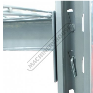
Internal Shelf Locking System