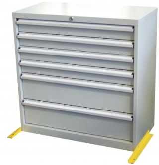
T775 6 Drawer - Industrial Tooling Cabinet