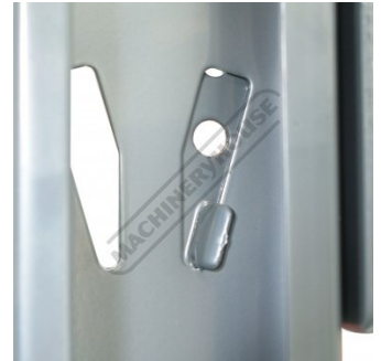
Internal Shelf Locking Wedge Type System