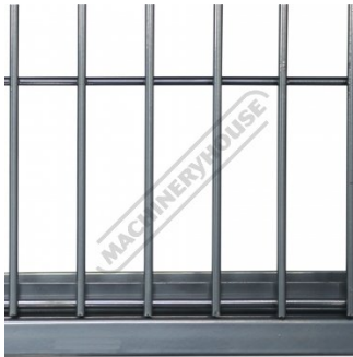
Shelf Wire Mesh