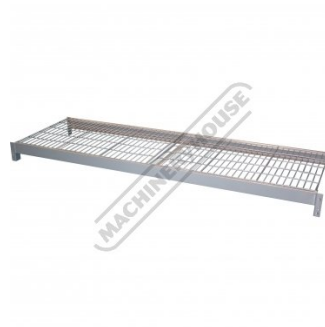
4 x Shelves