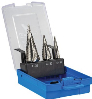
D107 HSS Step Drill Sets