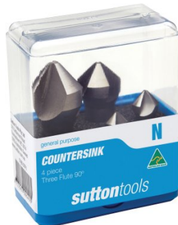
D106 Countersink Sets – 90° Three Flute