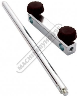
Support Arm Extension Kit