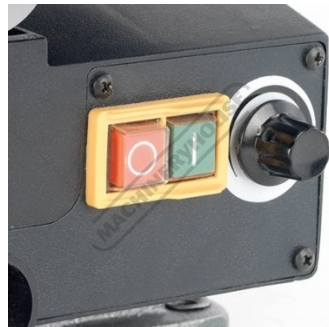
Smooth and Responsive Variable Speed