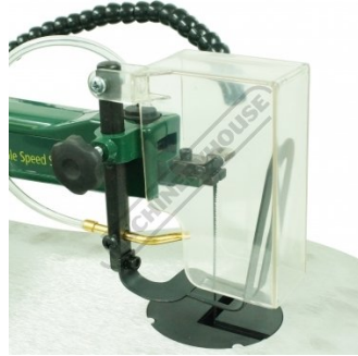
Adjustable Dust Blower and Safety Clamp