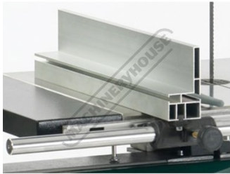
Industrial Style Fence