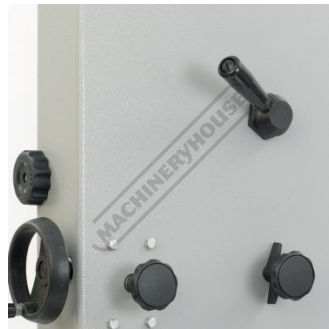
Cam Action Tensioner