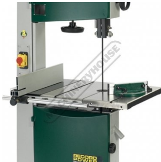
Large 535 x 480mm Cast Iron Table