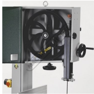
Cast Iron Band Wheels