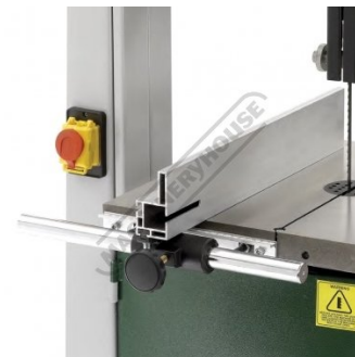
Industrial Style Fence