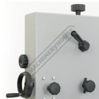
Cam Action Tensioner