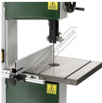
Large Cast Iron Table