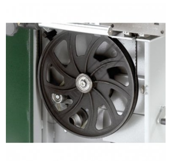
Cast Iron Blade Wheels