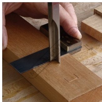
Easy and Accurate Corners