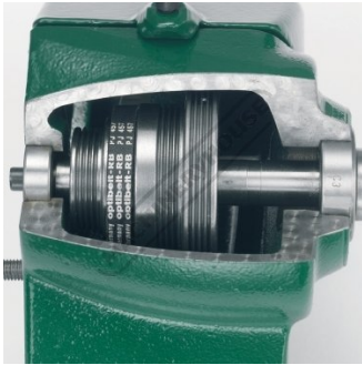
Solid Cast Iron Headstock