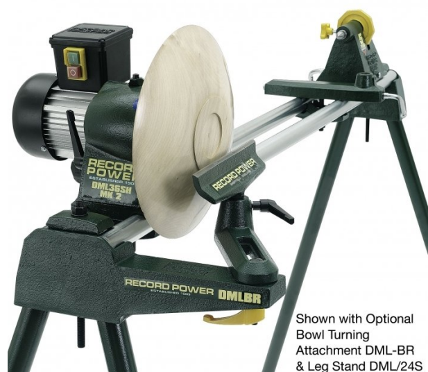
Shown with Optional Bowl Turning Attachment DML-BR & Leg Stand DML/24S