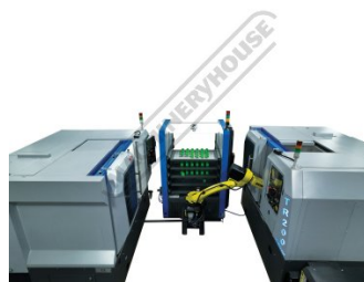
Shown Tending 2 Machines