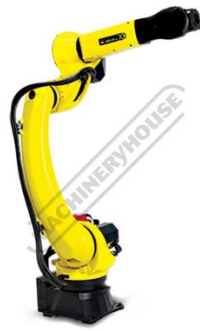
FANUC industrial robot