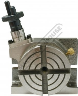
Front View on Edge