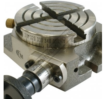
Graduated Rotary Table 360 Degrees