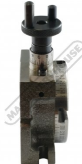
Side View on Edge