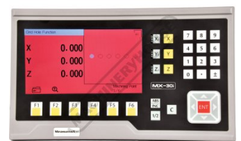
Grid Hole Function