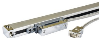
Q8527 470mm Digital Readout Scale