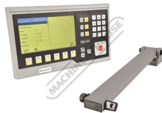
Mounting Arm Extension