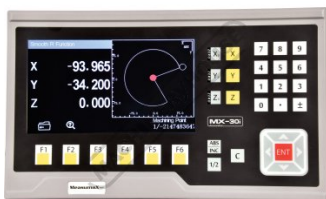
Smooth Radius Function