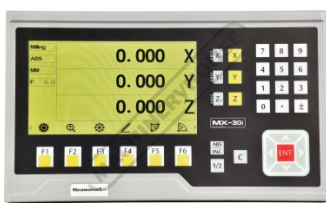
Multiple pre set display colours