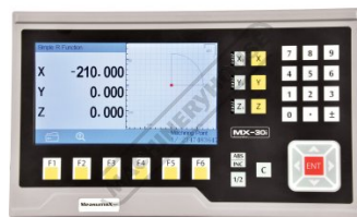
Simple Radius Function