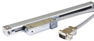
Q8513 270mm Digital Readout Scale