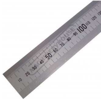
Metric Close Up