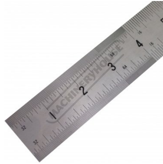
Imperial Close Up