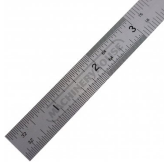
Imperial Close Up