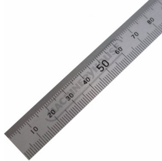
Metric Close Up