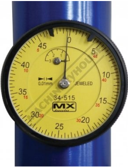
Jeweled Metric Dial