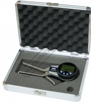
Shown in Case