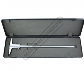
Shown In Box