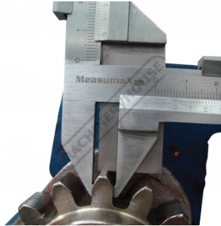
Shown measuring gear