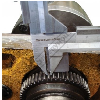
Shown measuring gear