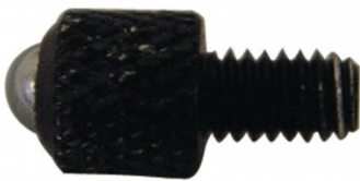
Q2168 Contact Point for Dial Indicators