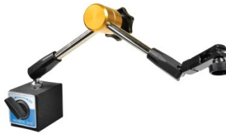
M051 Magnetic Base - Deluxe - One Lock