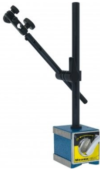
Q4351 Magnetic Base - Large