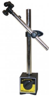
Q436 Magnetic Base - One Lock (Large)