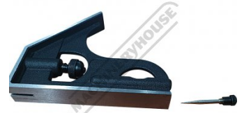
Includes Short Scriber