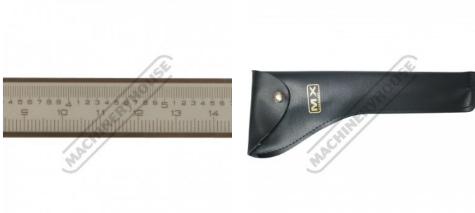
Metric and Imperial Graduations