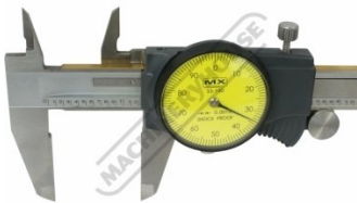
Head Close Up