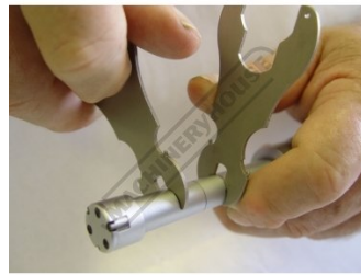
Spanners Shown In Use