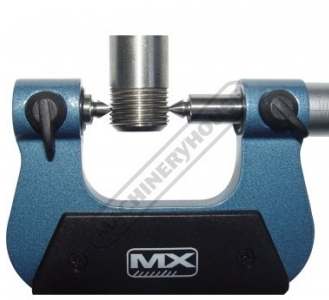
V shaped and cone shaped anvils