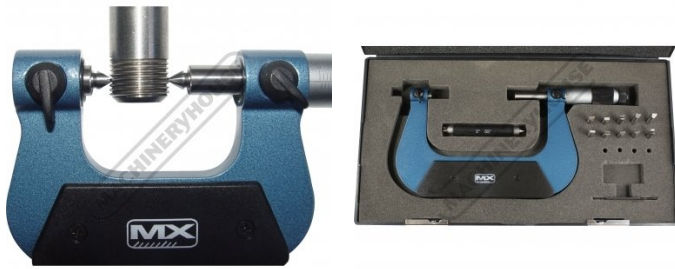
V shaped and cone shaped anvils Shown In Box