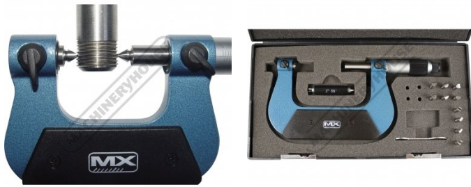
V shaped and cone shaped anvils Shown In Box