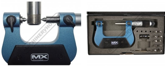
V shaped and cone shaped anvils Shown In Box