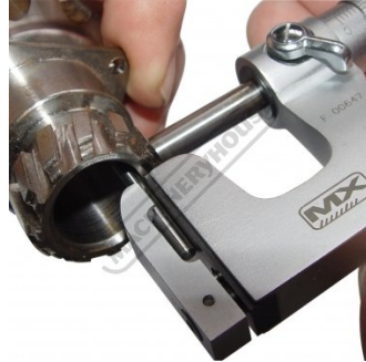
Pin Anvil Measuring