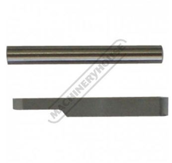
Blade and Pin Anvils