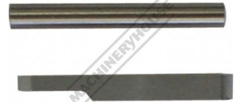
Blade and Pin Anvils