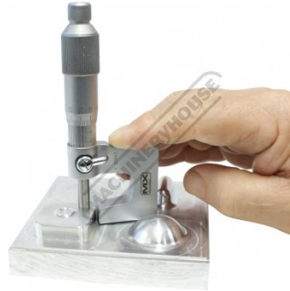
Vertical Height Measuring