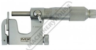
Shown with Blade Anvil