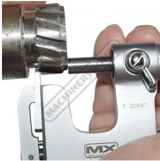
Blade Anvil Measuring