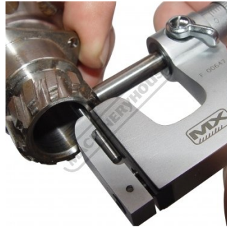
Pin Anvil Measuring