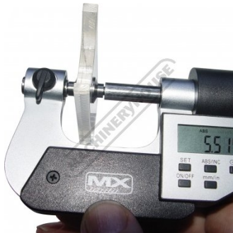
Shown In Use with Blade Disc Anvil