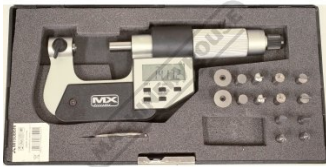
Complete with Case