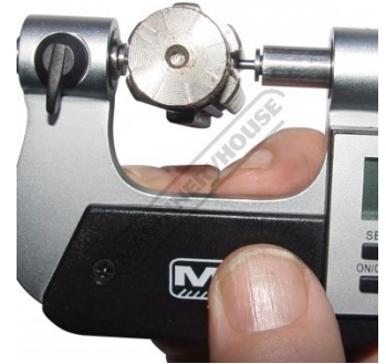
Shown In Use with Blade Spline Anvil