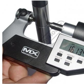
Shown In Use with Blade Anvil