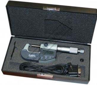
Shown in Box