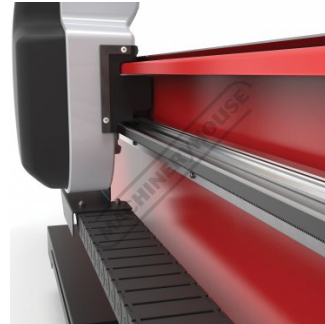
Linear Rail Rack-Side