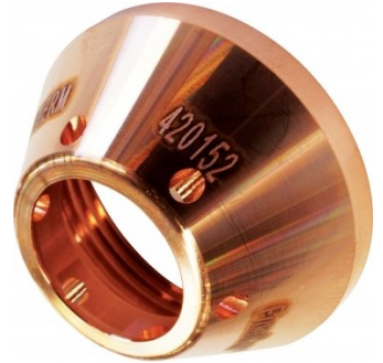
P856 Hypertherm FineCut Only Shield