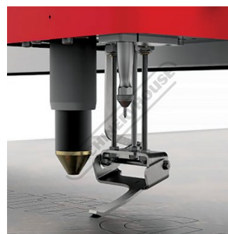
Initial Height Sense