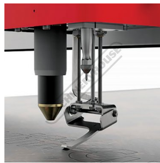
Initial Height Sense