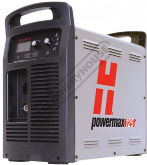
Supplied With Powermax125