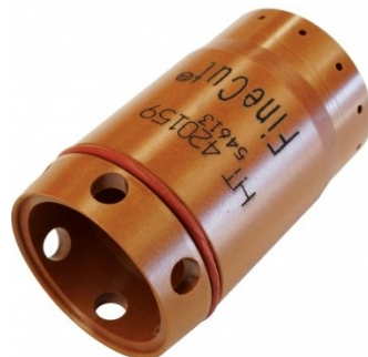
P858 Hypertherm FineCut Only Swirl Ring