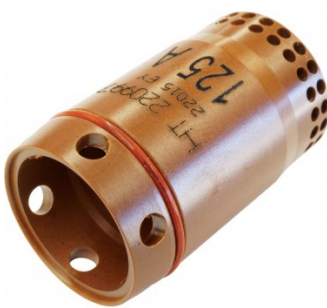
P857 Hypertherm 125A Swirl Ring