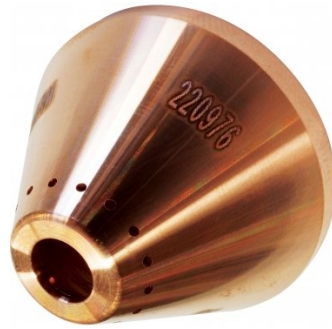
P854 Hypertherm 125A Shield