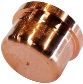
P853 Hypertherm FineCut Only Nozzle