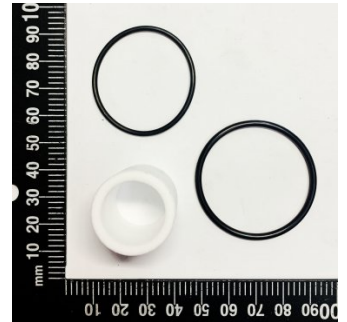
AP0001 Air filter element kit -Internal Cap