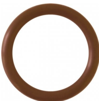
AP0006 Hypertherm O-Ring