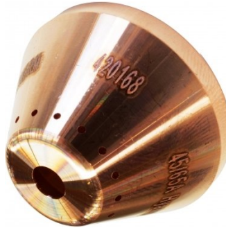
P855 Hypertherm 45-65A Shield