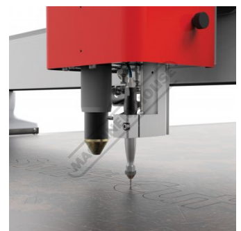
Optional Engraver Shown