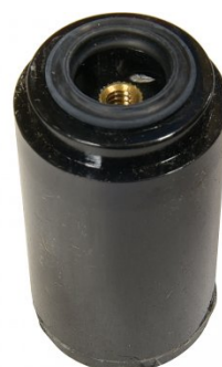
P8081 Hypertherm Elimizer Filter - Replacement filter element