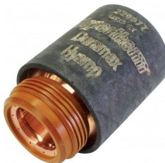
P859 Hypertherm 30-125A Retaining Cap