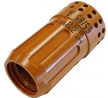
P843 Hypertherm 45-85A Swirl Ring