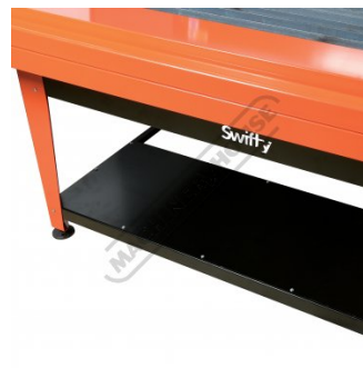
Stand with Storage Shelf