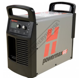
HYPERTHERM Powermax 65