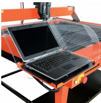
Shown with Optional Laptop