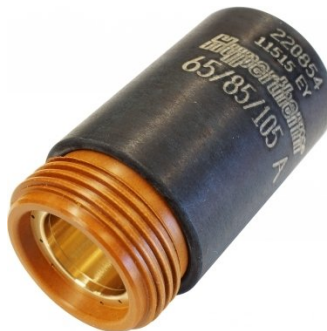
P848 Hypertherm 65-105A Retaining Cap