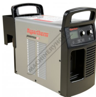
HYPERTHERM Powermax 65 Left View