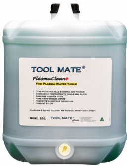
P799 Plasma Water Table Fluid