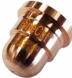
P842 Hypertherm FineCut Only Nozzle