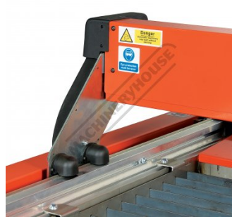
Gantry Roller Support Left View