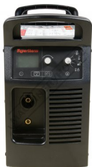
HYPERTHERM Powermax 65 Front View