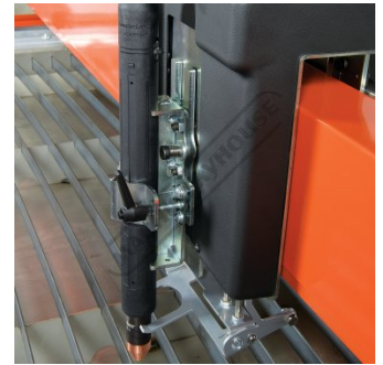
Breakaway Torch Return Position