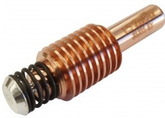
P837 Hypertherm 30-105A Electrode