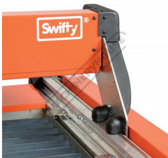
Gantry Roller Support Right View