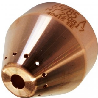
P845 Hypertherm 45-85A Shield