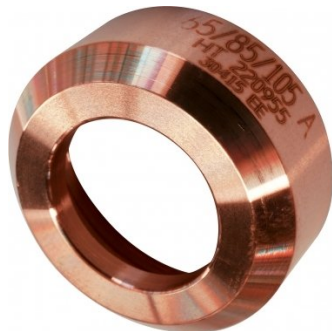
P847 Hypertherm 45-105A Deflector