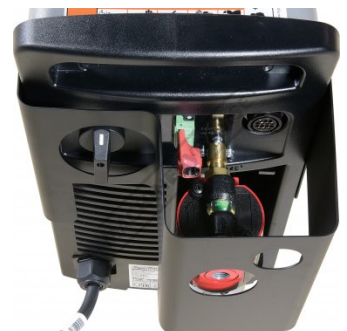
HYPERTHERM Powermax 65 Rear Top View