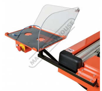
Laptop Table with Data Cable