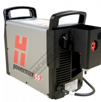
HYPERTHERM Powermax 65 Rear View