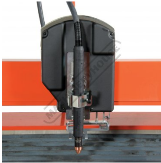
Torch Front View