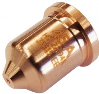
P838 Hypertherm 45A Nozzle