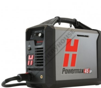
Hypertherm Powermax 45XP