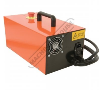
Control Unit Rear View