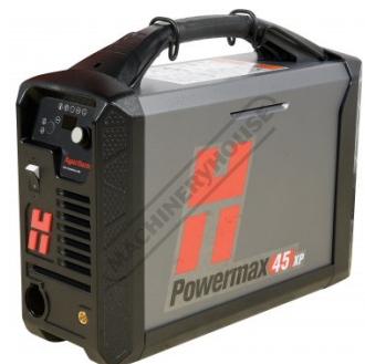
HYPERTHERM Powermax 45 XP