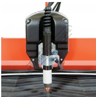
Torch Front View