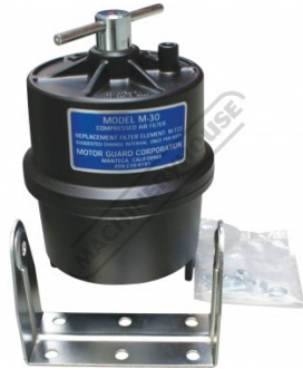
M-30 Air Filter C492