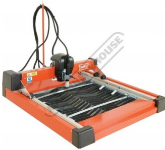
SWIFTY Left View