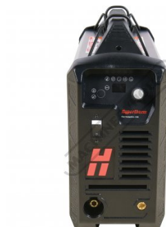
HYPERTHERM Powermax 45 XP Front View