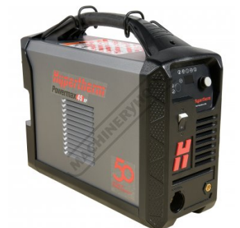
HYPERTHERM Powermax 45 XP Left View