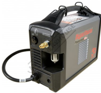
HYPERTHERM Powermax 45 XP Rear View