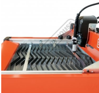
Water Table Side View