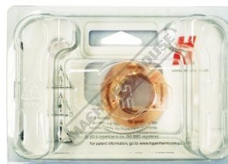
Packaging Rear View