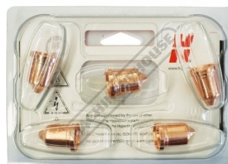
Packaging Rear View